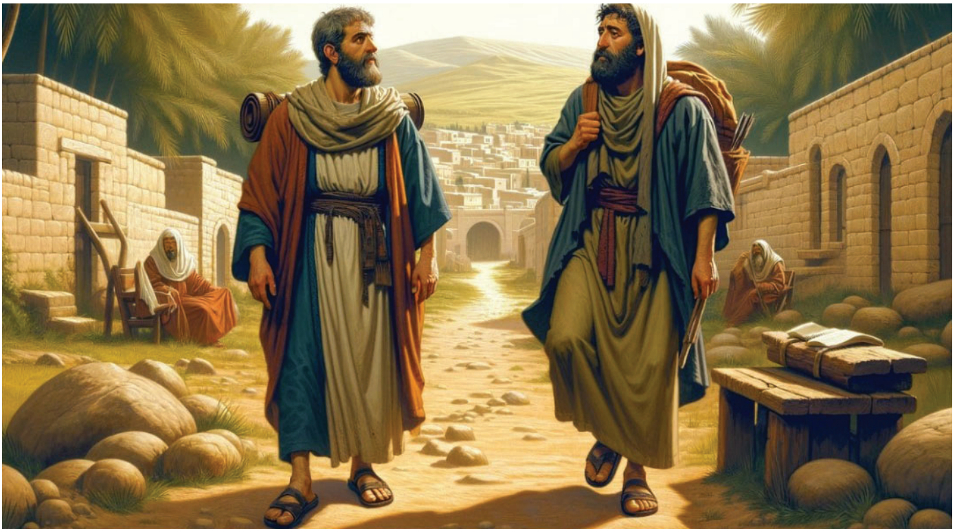
Saul of Tarsus (Paul) and Barnabas

As the early church began to grow, in spite of Herod’s persecution, Barnabas was called by the Holy Spirit to go with Paul on a missionary journey. Barnabas’ cousin, John Mark, served him and Paul as their assistant (Acts 13:5). During that first mission trip, for an unspecified reason, John Mark left them and did not complete the journey (Acts 13:13). However, Barnabas continued with Paul and was with him when Paul’s ministry was redirected to reaching the Gentiles with the gospel (Acts 13:42-52). The only negative mention of Barnabas in Scripture is in reference to an incident in which Peter’s hypocrisy influenced other Jews (including Barnabas) to shun some Gentiles at dinner (Galatians 2:13).